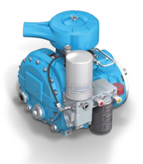
Power range: 3.0 - 18,5 kW Volume flow at 10 bar(g): up to 2.1 m<sup>3</sup>/min