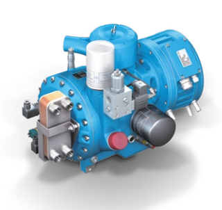
Power range: 2.2 - 11 kW Volume flow at 10 bar(g): up to 1.2 m<sup>3</sup>/min