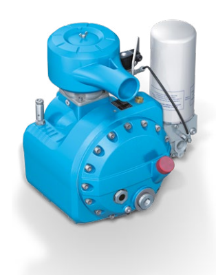
Power range: 7.5 - 37 kW Volume flow at 10 bar(g): up to 4.4 m³/min